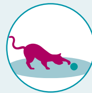
Chasing moving objects